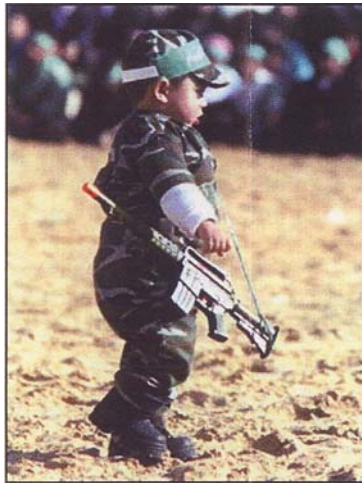
Photo from the Web site of "The Azzadin Al-Qasam Brigades," the military wing of Hamas. The headline over the photo reads, "Special shots of the mujaheedin (holy warriors) of the martyr Azzadin Al-Qasam Brigades."

International terrorists continue to use facilities within the United States to propagandize, incite, recruit, fundraise and to share knowledge about explosives, poisons and the means of using these to attack Western interests. The facilities that these terrorists use are the providers of fast and reliable Internet service, which allows them to spread their messages to a global audience. Companies that lease space on their computer servers have rules about the materials and content that can be placed on Web sites, but with millions of pages online — often in foreign languages — Internet providers and the hosts of Web sites and computer servers in the U.S. have found that their services have been used by terrorists to post their hatred